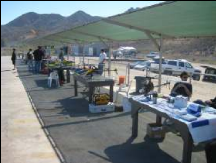
Only one Swap Meet entry for the day. ????????????